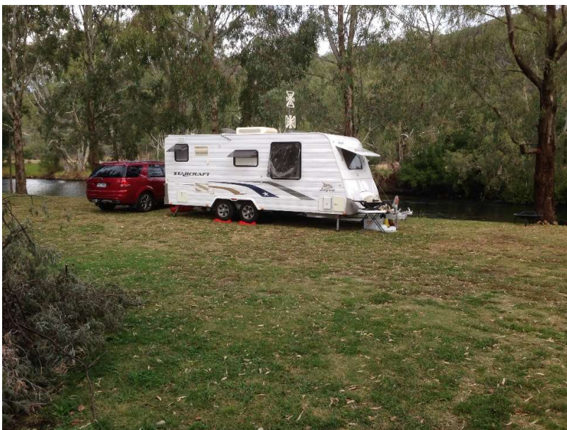
Our free camping site next to the Tumut River

We headed back to camp after coffee and relaxed before heading off to the pub for dinner. I can't be bothered cooking tonight so taking the easy way out. Maree decided to have the smoked Snowy Mountain trout and I had the chicken schnitzel with a green peppercorn sauce. Both meals were served nice and hot and were delicious. Maree said she really enjoyed the trout.