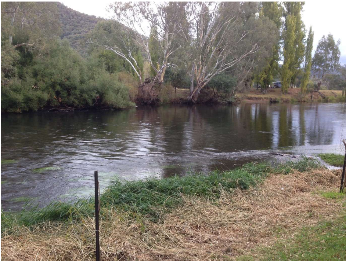
Tumut River Jones' Bridge

The free parking area was quite busy when we arrived with several vans and one motorhome parked in the area. However, the area is quite large and can accommodate these vehicles quite easily without people parking on top of each other. We have parked close to our usual area which gives us a great view of the Tumut River and the classic sounds of the water passing over the stony riverbed. A very pleasant experience.