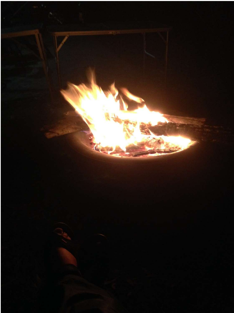
The roaring campfire

Tonight, we had a lovely evening as we were joined by two other couples that had arrived during the day. So, we all pitched in and provided something for dinner and sat around our campfire for hours. I think I finally got to bed around midnight. A great night.