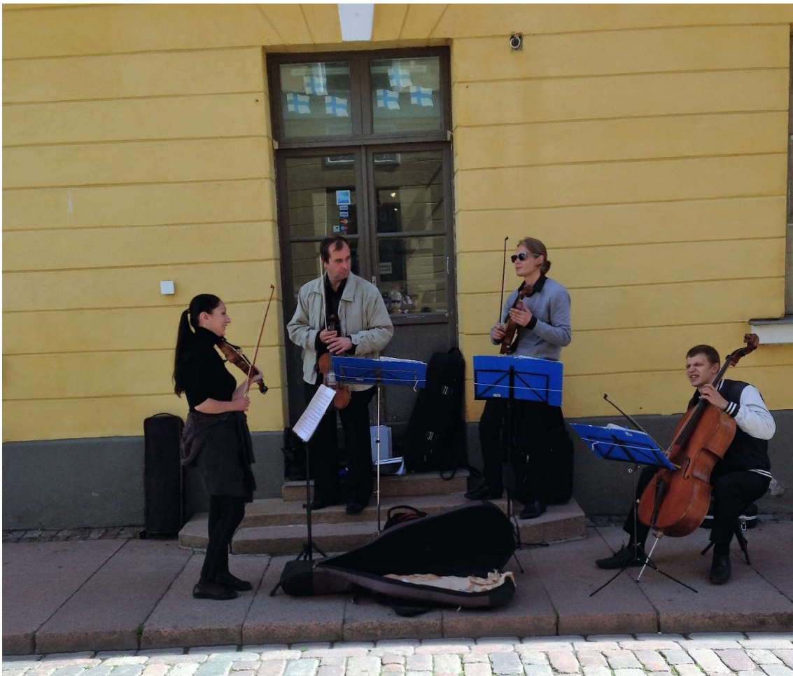
The string quartet playing some great classical pieces

As we walked the streets of Helsinki we came across a string quartet. They were play some great classical pieces and we stayed around to listen to them for a while. It was worth putting some euro into their case; and of course we did.