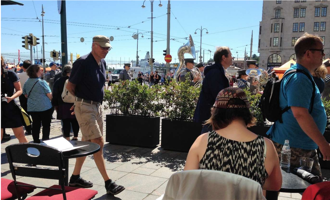
People watching during lunch