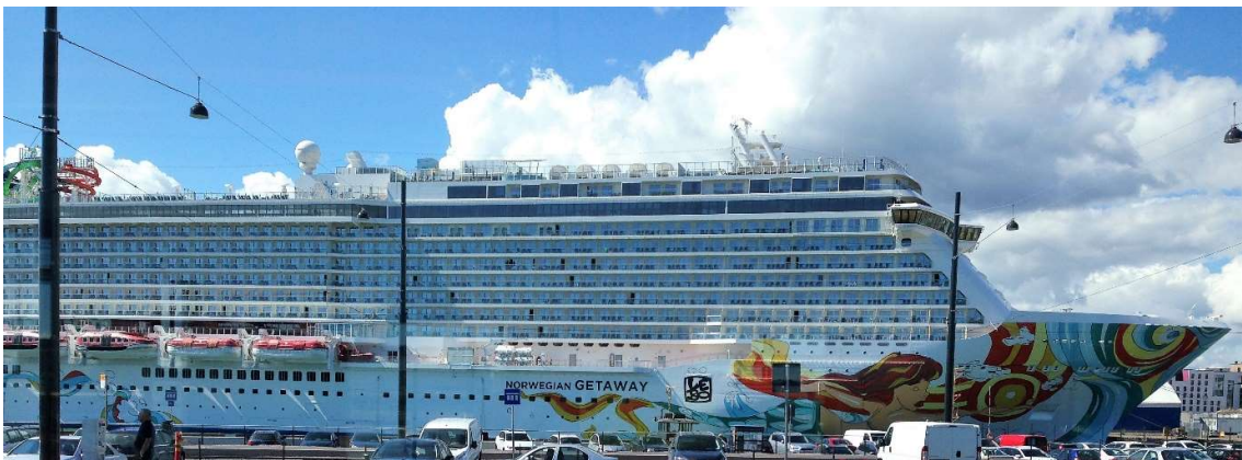
The Norwegian Line "Norwegian Getaway"