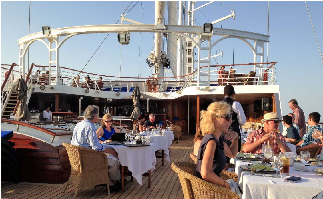
View of Candles Restaurant on rear of Wind Star