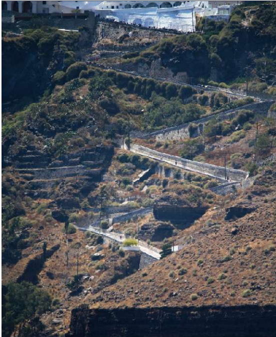
The long walk if you don't take the cable car option