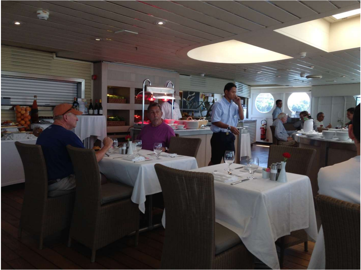
Veranda Restaurant for Breakfast and Lunch