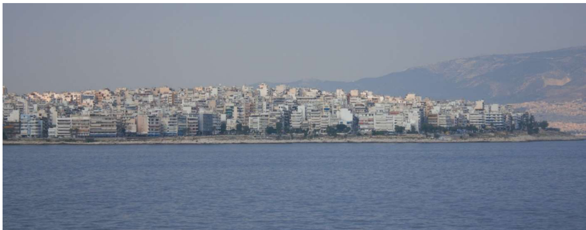
View Departing Piraeus