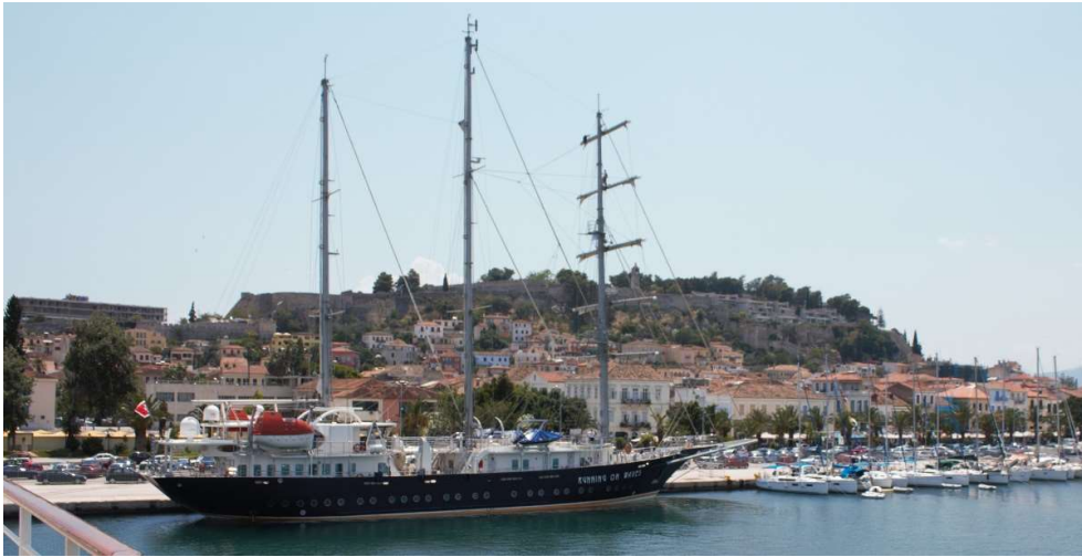
View of Nafplio Harbour