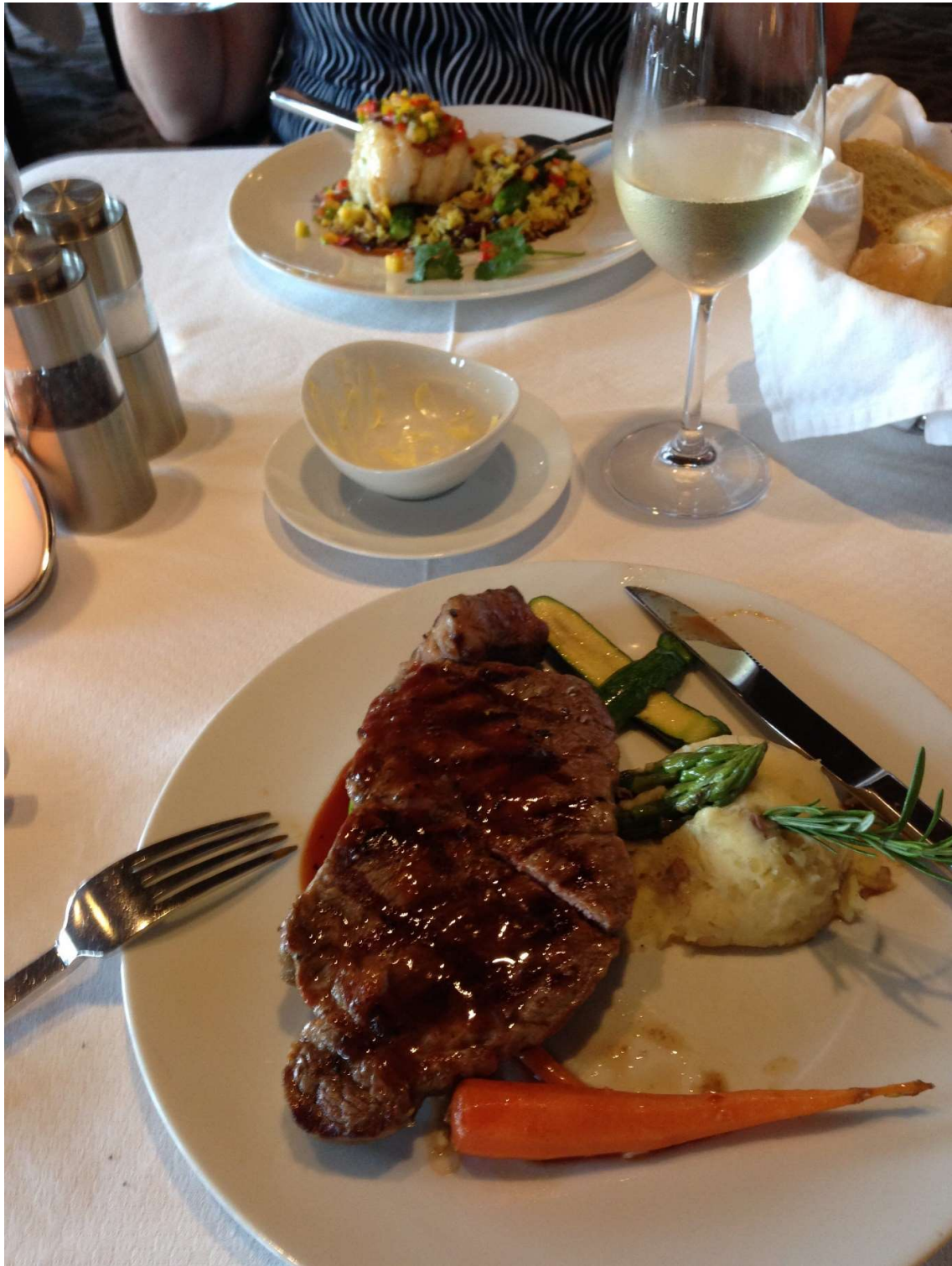
Main Course Angus Steak (Steve) Sole Roulade (Maree) - AmphorA Restaurant