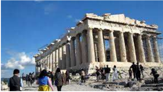
Parthenon with the crowds