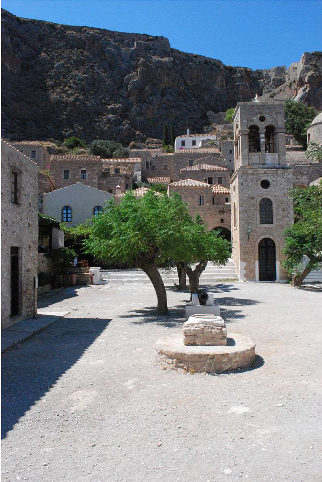
Monemvasia Town Square