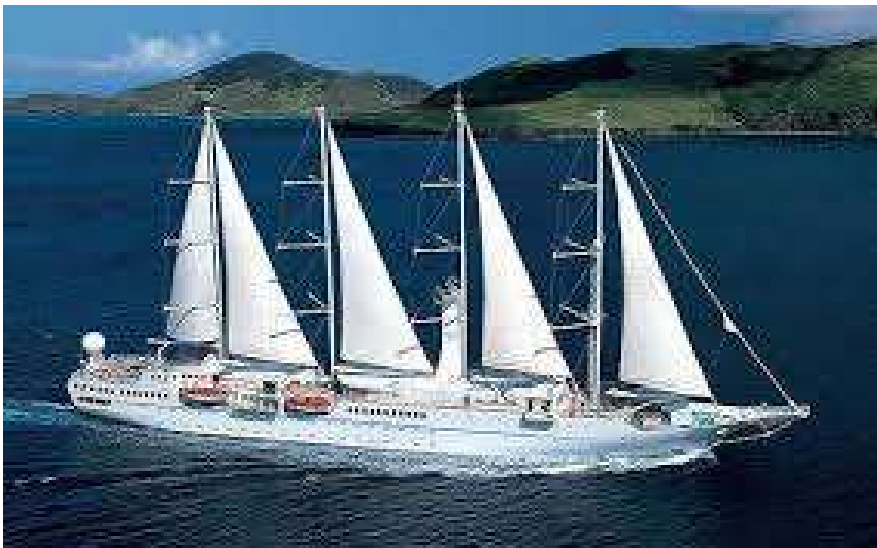
Image of our yacht, WINDSTAR