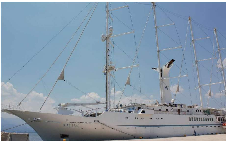
Our Yacht "Wind Star" in the port of Nafplio

It is lunchtime now and Maree has been able to get out of bed and stand up herself which is a positive sign; but still in a little discomfort. She is still not venturing out the cabin at this stage. Windstar does not have elevators or wheel chairs to assist movement. Also it is one flight of stairs to the main restaurant for the evening meal and two flights to the deck and for lunch. Fortunately they also provide room service for all passengers so we are persevering with room service for Maree's meals at the moment. She is happy but really frustrated she just can't get up and move around. All being well, especially as she was able to get up herself at lunchtime, she will be able to start to move around the ship tomorrow and we can see how she goes tomorrow before we consider doing excursions. Tonight we sail from Nafplio to Mykonos.