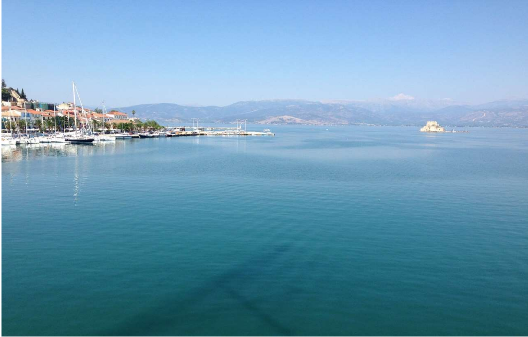
View from the yacht in Nafplio Harbour