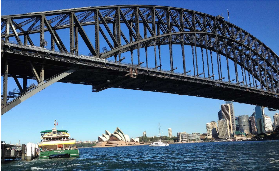
Sydney Harbour Bridge and Ferry