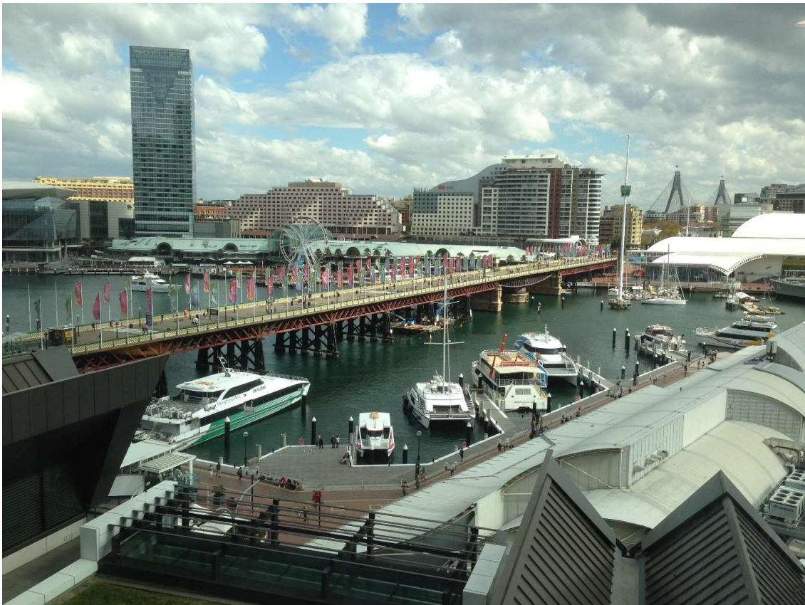
View from the hotel room

the taxi was worth the few dollars extra. Taxi fare was $65.00 and at the time of day we were travelling the fare would not have been a lot cheaper if we travelled by train.