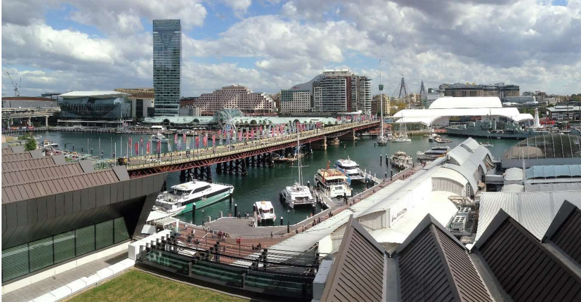
Panoramic view from our room

After checking in, and checking out the view from our room, we went for a leisurely walk around Darling Harbour and stopped at Nick's for lunch. We remembered eating at Nick's for an evening meal on a previous occasion and the food was very good. After a relaxing lunch we decided we would book in for dinner tonight as their seafood menu looked very nice. After lunch we decided we would take the ferry all the way to Watson's Bay and return. There is a city ferry terminal at Barangaroo, only a short walk from our hotel in Darling Harbour.