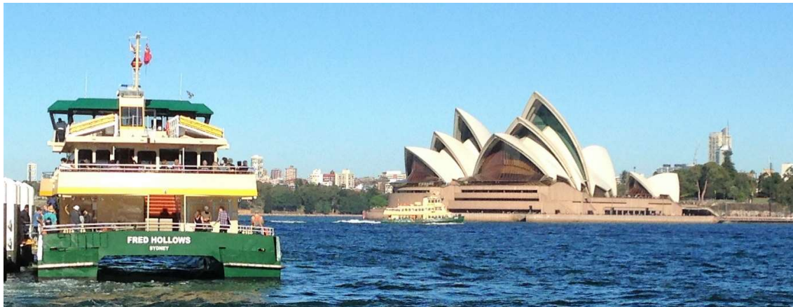
Sydney Opera House on the way to Manly.

Today we decided to go to Manly for the day. Once again we decided to use the ferries to spend time relaxing on the harbour. The ferries are the best way to get to areas located on the harbour.