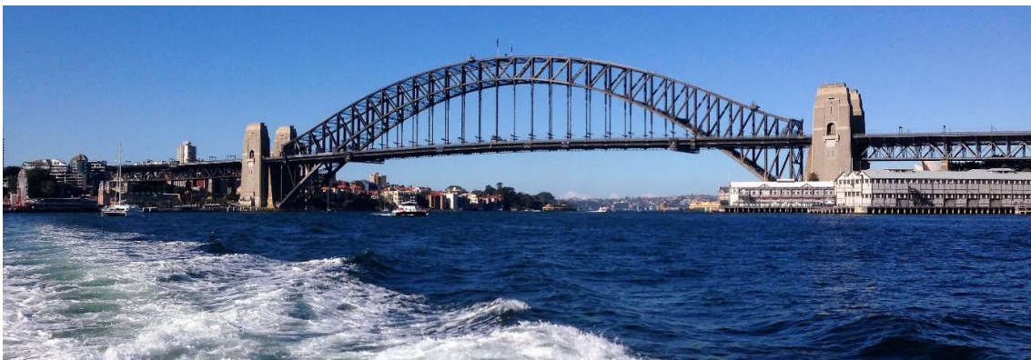
Sydney Harbour Bridge